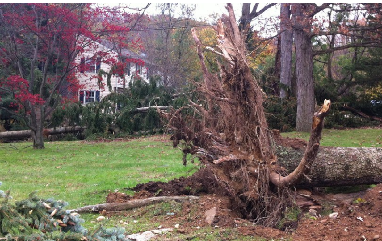
Aftermath of Hurricane Sandy. Spruces have fallen [foreground, background] while the white oak are still standing. October 2012. Ossining, NY.