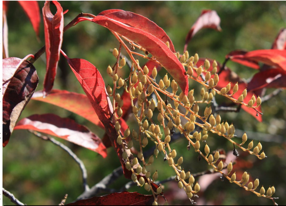
Sourwood autumn leaves and fruit. October 2013. Natural Bridge, KY.

When walking around after Sandy, it was amazing to see the patterns in neighborhood yards. Eastern white pine down or broken up crown – check. Norway maple shredded – check. You can learn a lot by taking apart trees for firewood. I dropped a few Norway maples. Detwigging them is illuminating. Pulling the branches back like you might with a wishbone leads to a popping off of the twig. Literally, they pop off. It is like Norway Maple branches are snapped on, not grown).