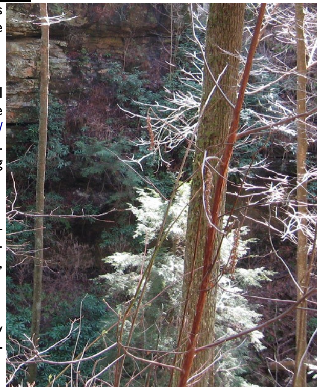
The cinnamon-colored bark on the small stem just right of center is the best picture I have of mountain pepperbush bark so far – apologies! Rock Creek, KY.

Red or bottlebrush buckeye ( Aesculus spp.) – Perhaps one of my favorite memories on potential occurred in the Sipsey Wilderness Area in northern Alabama. While hiking to seek out some old-growth in that tract, the understory in first ca 1/3 of a mile was filled with buckeye. It was early enough in the spring season that