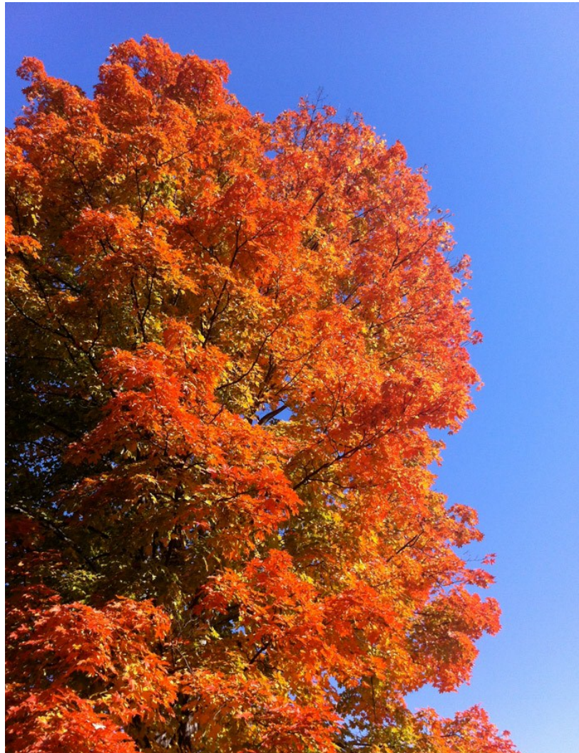
Sugar maple. October 2012. Nyack, NY.

A superb study on windfall and tree species occurred in an old-growth forest in South Carolina after Hurricane Hugo. Putz and Sharitz (1991) surveyed the bottomland hardwood forest and sloughs of the Congaree National Park soon after Hugo. Their insight is extremely instructive. Only one –one! - baldcypress was observed to have uprooted in the eight days of field work and it seems that the one tree was not in any of the surveyed plots. In stark contrast, only 46 of the 100 loblolly pine surveyed in plots survived Hugo. The tap-rooted and broad root system of the baldcypress, anchored by their knees, gave them increased resistance to Hugo's winds. Further, the small, feathery, and deciduous needles of the baldcypress catches less wind (and ice, snow, etc.) than the heavily-needled loblolly pine or wind-gathering leaves of cherrybark pine or sweetgum. While water tupelo ( Nyssa aquatica ) took much crown damage from the wind, it was less apt to falling. It was observed to have been severely defoliated. Sometimes letting go of possessions saves you.