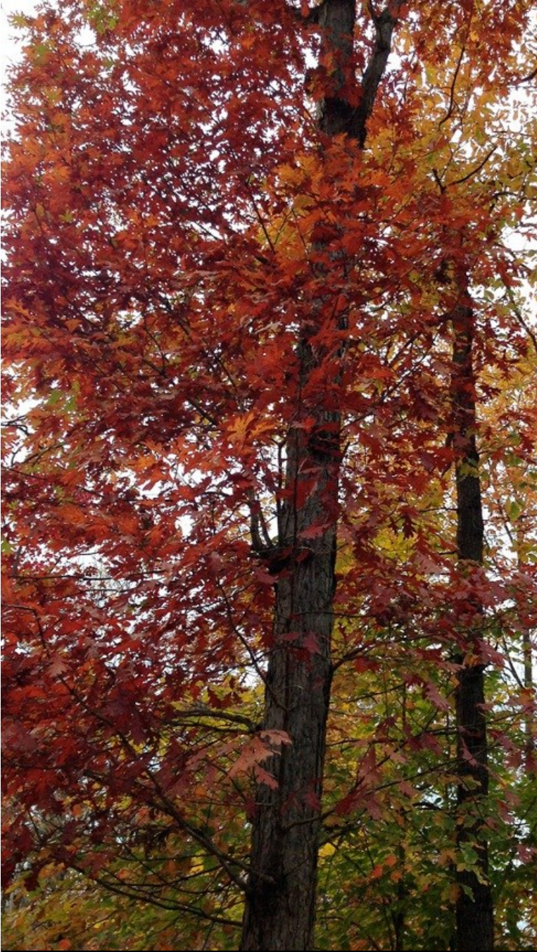
The red leaves of a glorious white oak. Blauvelt State Park, NY. Nov 2013.

Pignut hickory ( Carya glabra ) – A medium-sized tree that lives more than 300 years that in a fairly rare genus, this species grows a taproot that will anchor it into the ground. And, it has pretty great color. Some years this species can really shine .