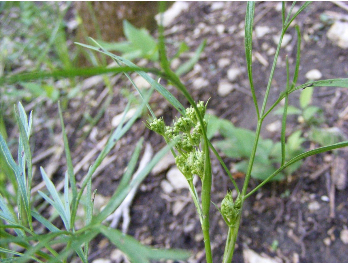
Wild dill

Two additional Cherokee park plants not listed by Slack and exciting for any botanist were recently found. The federally endangered running buffalo clover ( Trifolium stoloniferum ) which once grew near Willow Park was discovered by a UK