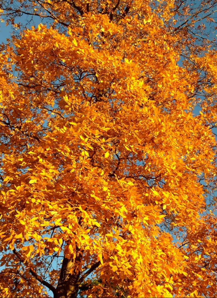
Pignut hickory in peak color. Palisades, NY. Nov 2013.

When you consider planting trees in your yard, investigate and consider how deeply a species roots naturally. Think about the species architecture. Is it a top-heavy species? Ponder the size of its leaves and how deciduous species are in general conditions. All trees fall. Minimizing this in your property while purposely developing years of spectacular autumn color will provide greatly anticipated events each year and memories that last for years.