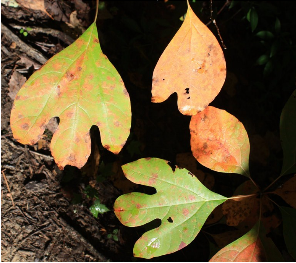
Sassafras at the beginning of the fall foliage season. October 2013. Natural Bridge, KY

only dwarf iris and other small herbs were in bloom. But, in my mind's eye, that understory would have been spectacular. Can't you imagine it? (Google image search of red buckeye: http://goo.gl/QalAH ).