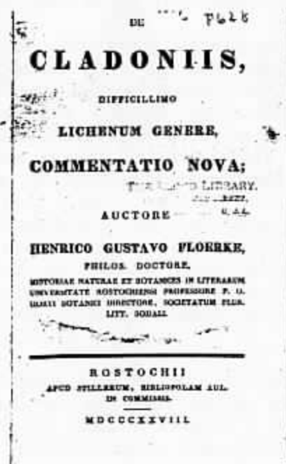
Fig. 2. Title page of De Cladoniis (1828), a book by the man - Gustav Heinrich Floerke - in whose honor Willdenow named the genus Floerkea . Copy in Lloyd Library, Cincinnati.