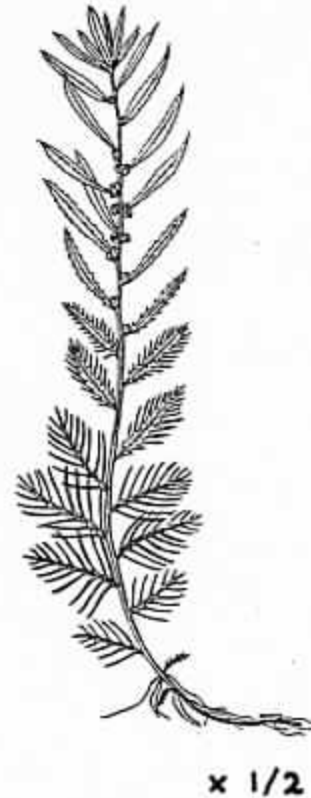
Fig. 3. Mermaid-weed ( Proserpinaca palustris ), submersed leaves below, emersed leaves above.