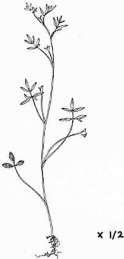
Fig. 1. False Mermaid ( Floerkea proserpinacoides ). Note vague resemblance of the middle and upper leaves to the submersed leaves of mermaid-weed (Fig. 3).