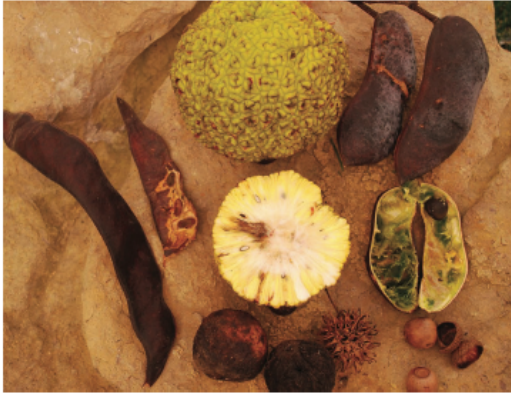
Defenses like that of the seed pods from the honeylocust and osage-orange trees are all adapted to the strength and size of megafauna.

painful in the wide mouths of ground sloths and mastodons. Wild honeylocusts have vicious, trident-like thorns several inches long covering the lower trunk and branches. Hollies have prickly leaves. Devil's walkingstick is festooned with wicked prickles. In all these heavily armored trees the thorns or prickles are present well above the reach of browsing deer, where they could still frustrate a mammoth's trunk or a giant ground-sloth's muzzle, but no higher. Cacti, Joshua trees, and other yuccas of the Southwest are particularly well armed in case the Shasta ground-sloths return.