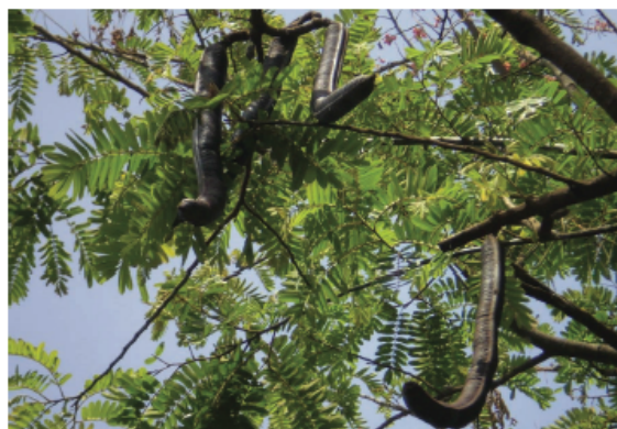
By eating their long seed pods, giant ground sloths were the primary dispersal system for Cassia grandis.