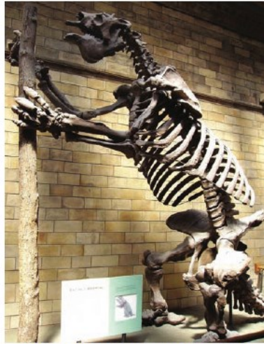
The giant ground sloth from London's Natural History Museum was once a dominant species in North America.

the same week. Likewise, all the animals and plants of 13,000 years ago belong just as much in the present. In fact, they still live in the present, with just one major exception: most of the big and fierce animals are now gone. This happened just a couple thousand years before we invented agriculture and planted the seeds of civilization. Woolly mammoths actually survived on some Arctic islands until after the Egyptian pyramids were built!