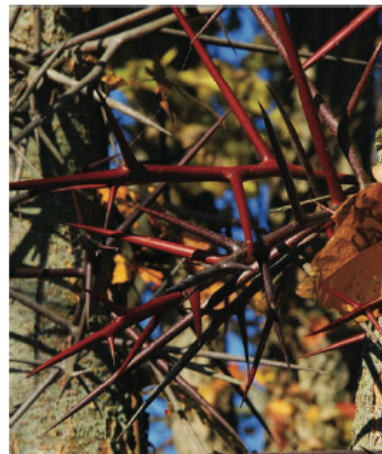
The thorns of the honeylocust once protected the tree's foliage from the giant ground sloths and other megafauna.

Now add the mastodons, a bit more than half the size of Columbian mammoths, but still weighing 5 tons. Throw in the 3-ton giant ground-sloth and its three smaller but still big relatives. Remember the horses, camels, llamas, shrub-oxen, stag-moose, woodland muskox, and others. Don't forget to think in terms of herds, and don't think of them in the Ice Age. Rather, see their ghosts in the present, along your favorite forest hiking trail or peering over a fence along the interstate. How different would our forests and other habitats now be? What aspects of forest ecology do we not understand because of their absence? Is the coffeetree really a floodplain tree? Is an Osage-orange growing wild east of the Mississippi a naturalized alien, or a reintroduced native?