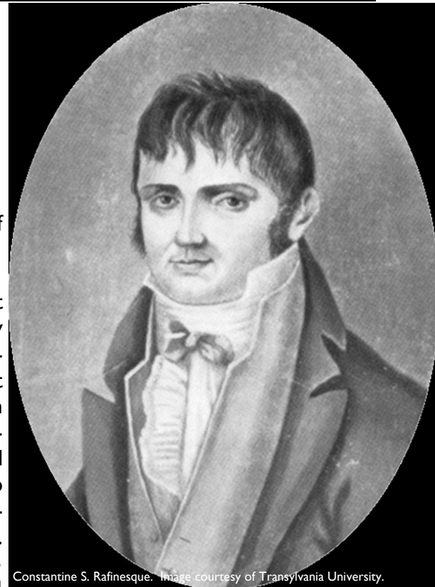
Constantine S. Rafinesque.

Rafinesque's many eccentricities are legend but there is no doubt of his legacy. His published articles and books total over 900 titles. Included among them is the first descriptive outline of the vegetation regions of Kentucky, as well as the first general account of the plant life of Kentucky. He also wrote a Medical Flora (1828-1830) that had great influence on the development of medical botany in the United States. His many descriptions of new genera and species have been studied over the last few decades, and many of his names have been resurrected. Over 100 genera and species in Kentucky bear the "Raf." author citation. Among the species named in memory of Rafinesque are Viburnum rafinesquianum and Viola rafinesquii .