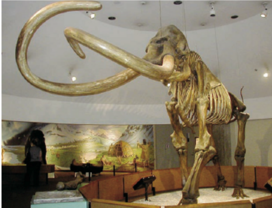
When it still roamed the earth, the Columbian mammoth acted as a dispersal system for many tree species that still exist today.

Warning: Reading this article may cause a whiplash-inducing paradigm shift. You will no longer view wild areas the same way. Your concepts of "pristine wilderness" and "the balance of nature" will be forever compromised. You may even start to see ghosts.