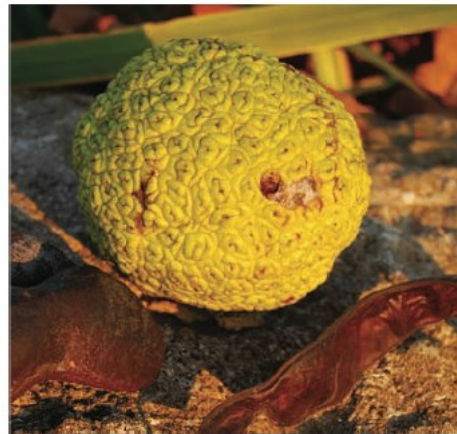
The Osage-orange tree once used this knobby green ball to attract large mammals to disperse its seeds. (Credit: Mark Wells)

Now when you see an Osage-orange, coffeetree, or honeylocust, you might sense the ghosts of megafauna munching on treats made just for them. (You may even see tropical ghosts in your local grocery store hungrily eyeing the avocados and papayas.) But you can also conjure megafaunal ghosts by considering the weapons designed by trees to discourage or slow their big mouths from eating the foliage.